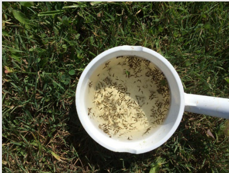
Larvae in dipping cup